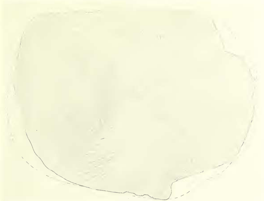
Holotypic scale of Cyclolepis stenodinus Cockerell (USNM 8703). Specimen, presumably from right flank of fish, drawn with anterior basal edge oriented to the right; external surface ornamentation somewhat diagrammatized, and small vertical striae between circuli omitted. (Magnification \times 9 .)